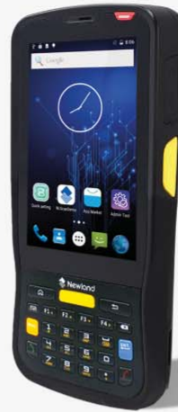
MT65 Beluga IV mobile computers