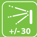
Wide Pose Angle Acceptance