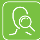
Touchless for Better Hygiene