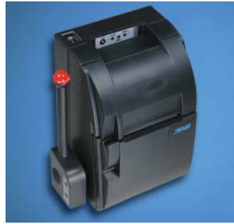
Built-In Wall Mount Capability and Optional Audio/Visual Print Messenger