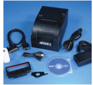
Includes Everything Necessary in the Carton