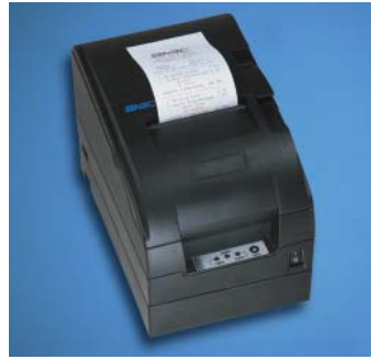
Conceal the Power Supply in the Optional Power Supply Cover