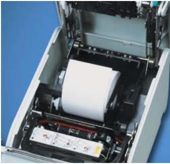
Drop and Print Paper Loading with Built-In Paper Width Selector