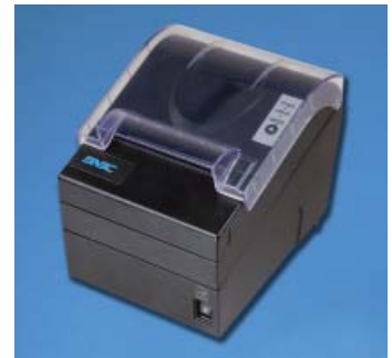
Optional Spill Cover