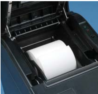
Drop and Print Paper Loading with an Adjustable Paper Width Selector