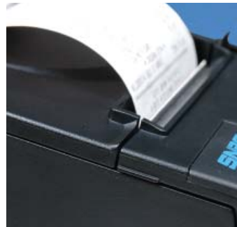
Liquid Guard Built Into the Cabinet Design