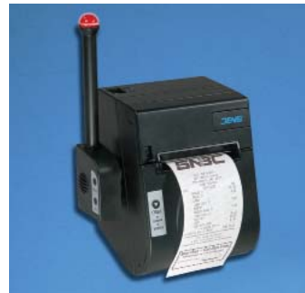
Built-In Wall Mount Capability and Optional Audio/Visual Print Messenger