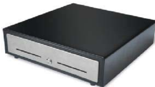
Stainless steel drawer front