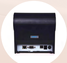
Triple-interface Ethernet, Serial, USB