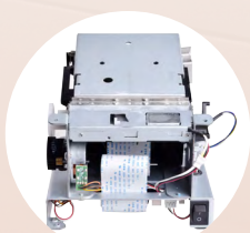
Metallic Printer Enclosure